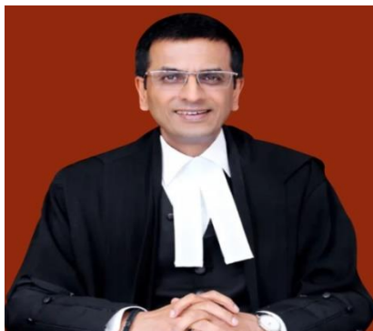
Hon'ble Justice (Dr.) Dhananjaya Yeshwant Chandrachud Chief Justice of India Supreme Court and Chancellor of the Maharashtra National Law University Mumbai